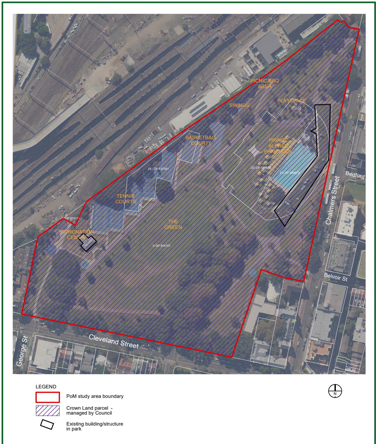
Figure 3. Site Plan