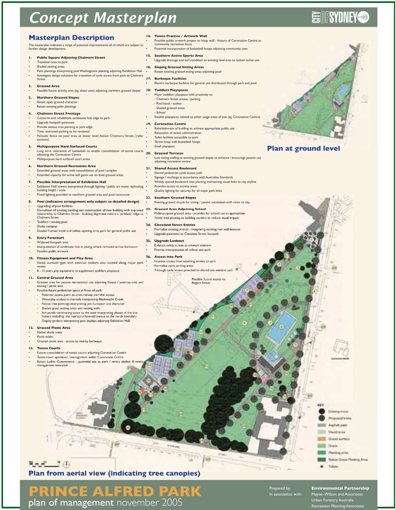
Figure 8. Master Plan