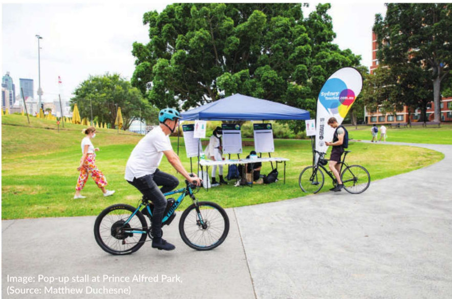
Image: Pop-up stall at Prince Alfred Park, (Source: Matthew Duchesne)