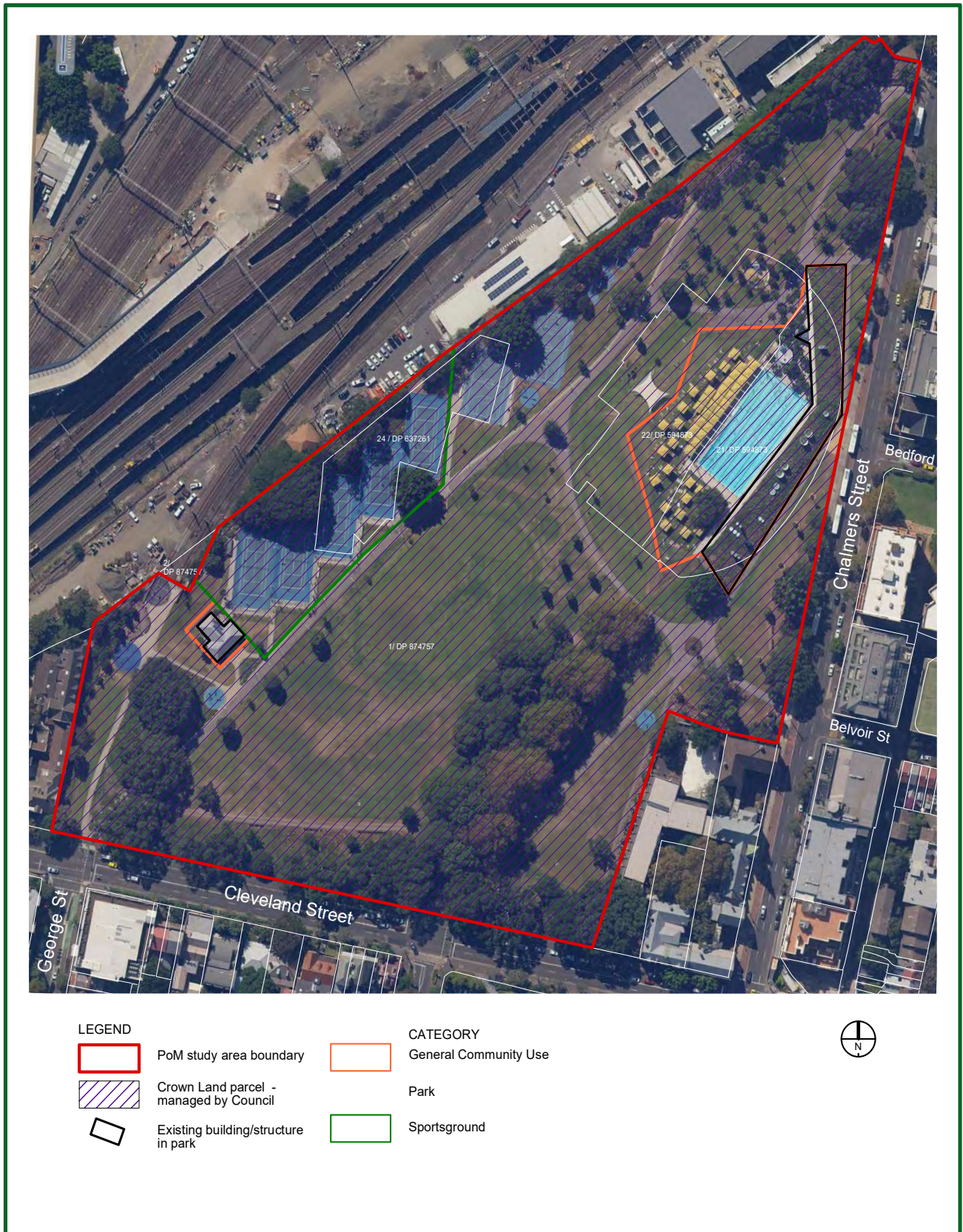
Figure 7. Community land categorisation map