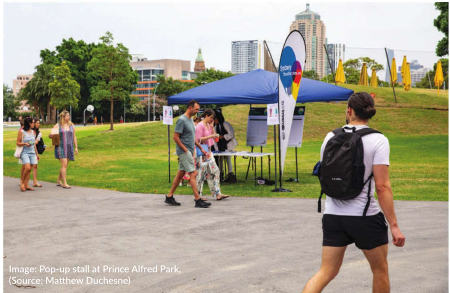
Image: Pop-up stall at Prince Alfred Park, (Source: Matthew Duchesne)