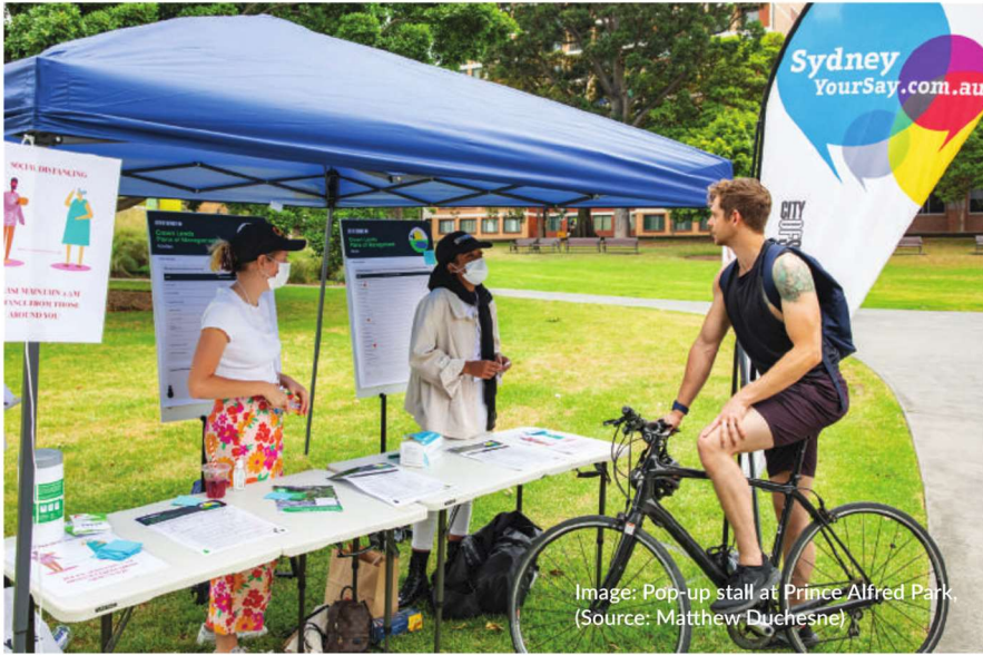
Image: Pop-up stall at Prince Alfred Park